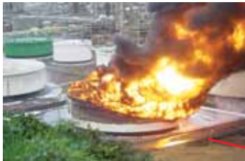
Above: A The 2007 fire at ENGEN burned for five days clouding South Durban with black smoke.

ENGEN (PICTURES RIGHT) OCT. 2001 Confirmed leak of about 15000 – 25000 litres of Diesel from an Underground pipeline close to houses in Pine Rd, Wentworth. American scientists report that 52% of children at Settlers Primary School are Asthma sufferers. School is 700m away from Engen. South Durban is home to 285 000 people.