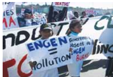
Above: SDCEA together with concerned residents protest outside ENGEN after the recent fires that were visible above our skies for five days.