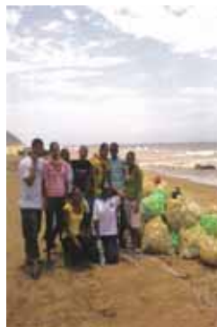
Below: A beach clean up held at Cuttings Beach in Merebank.